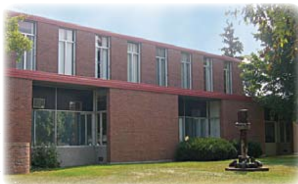
Drs. Edward E. & Lillian B. Redcay Hall

It looks like our wish will come true. The SUNY capital projects list, approved by the State legislature, now includes a provision for a new home for the School of Business & Economics. Construction is expected to begin immediately after completion of the new science building on campus.