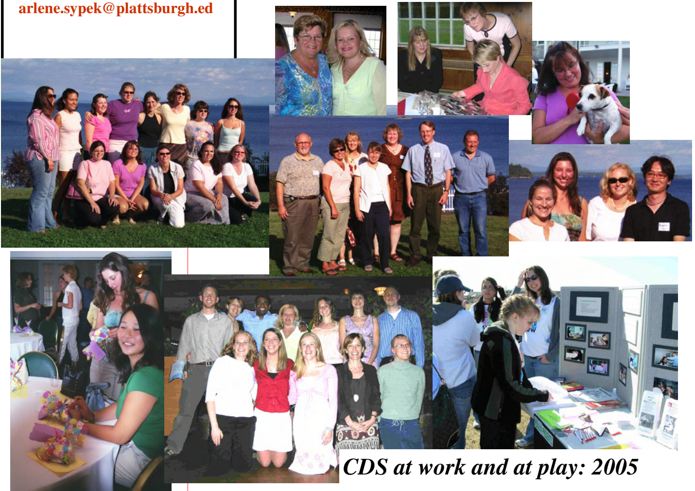
CDS at work and at play: 2005