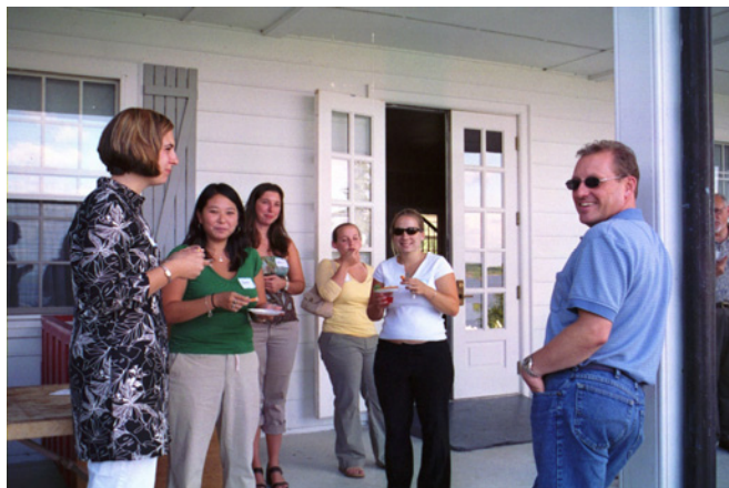
Welcoming new graduate students at Valcour, Fall 2005