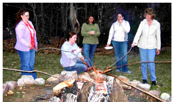
NSSLHA members have a little R & R with a bonfire.