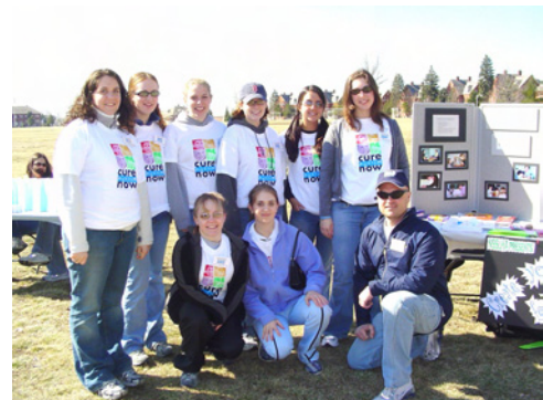
NSSLHA members volunteer for the Cure Autism Now Fundraiser.