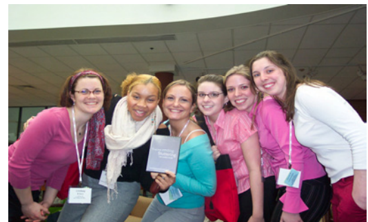
Plattsburgh State undergraduates attend the 2005 New York State Speech Language Hearing Convention in Long Island